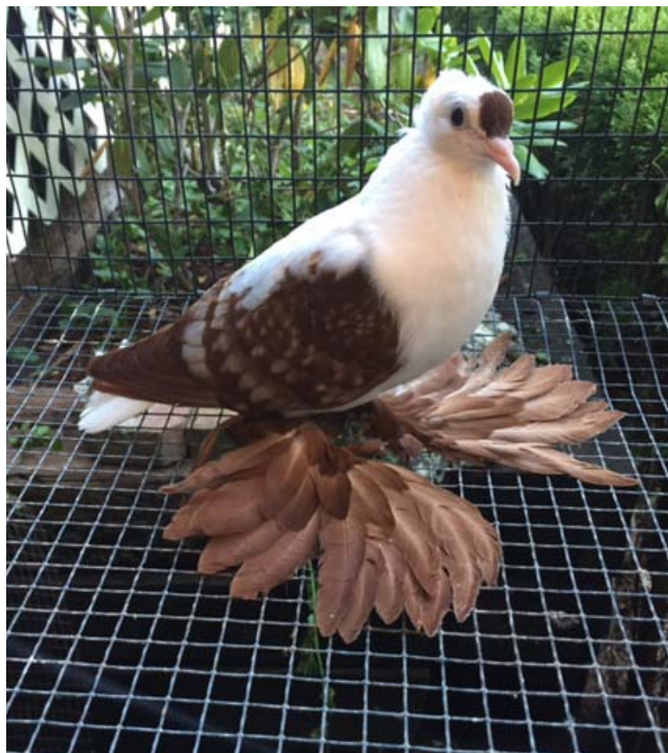
Baby red spangle Saxon Wing Pigeon.